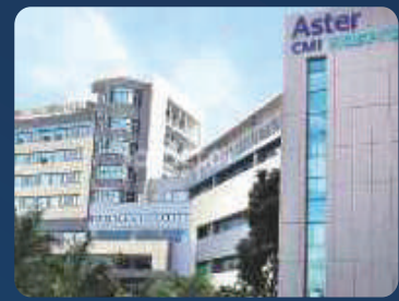
Aster CMI Hospital