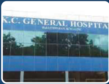
Govt. Hospitals in Bangalore