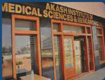
Akash Institute of Medical Science