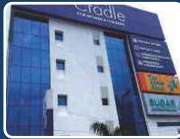
Apollo Cradle Maternity & Children's Hospital